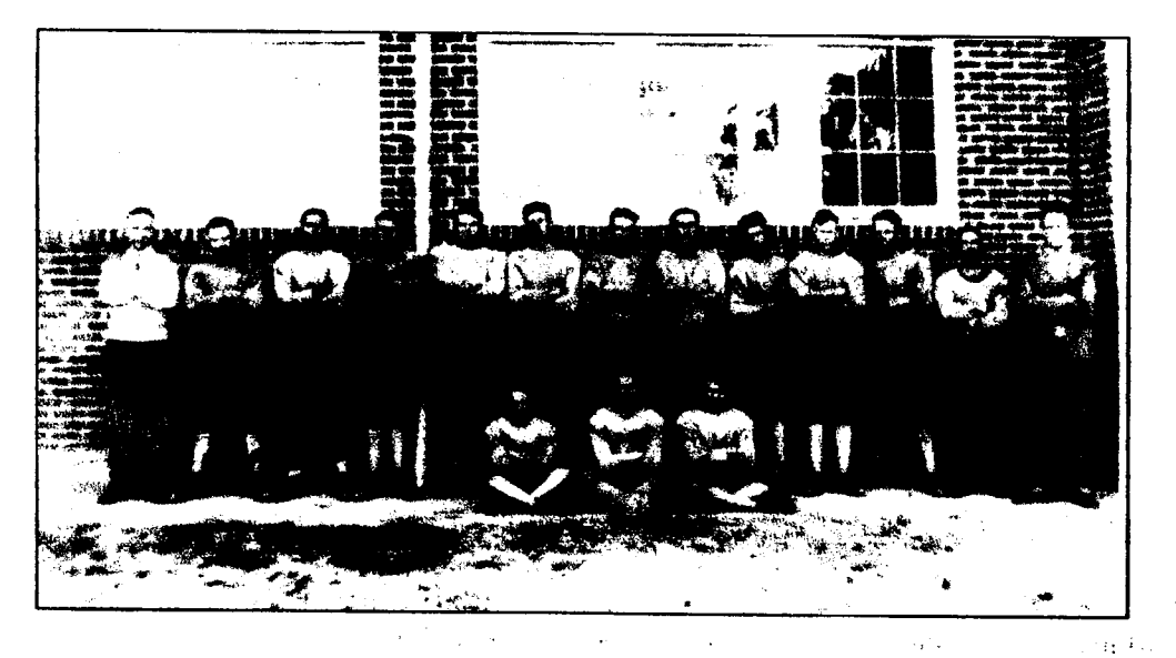
Chidester Football Team of 1928