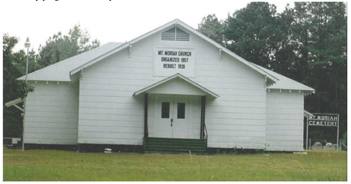
Mt. Moriah church as it appeared in 1993

This year (2007) marks the 150<sup>th</sup> anniversary of Mt. Moriah church. An old fashioned singing has been planned for the Saturday before Mother's Day in addition to the annual Mother's Day program on Sunday.