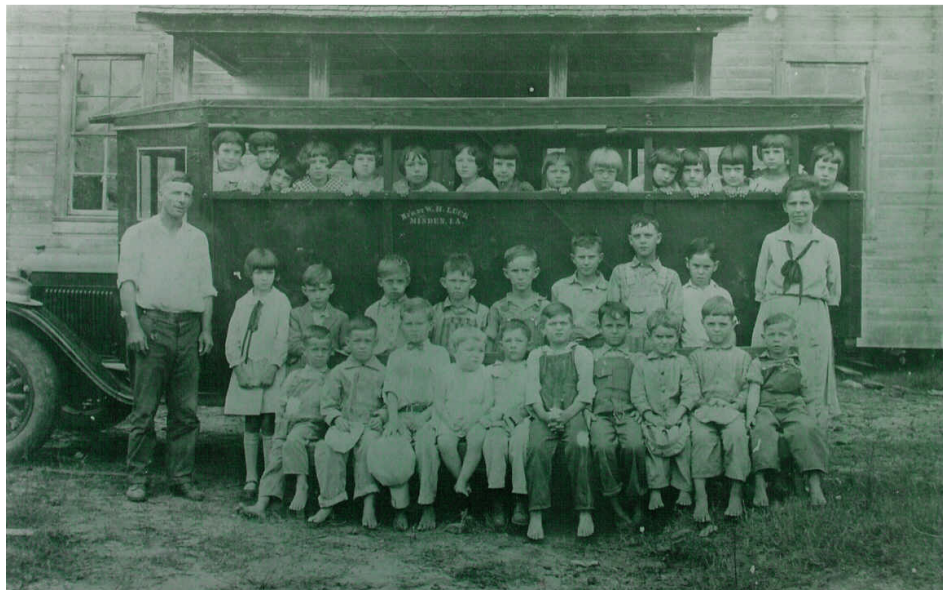
Bluff City school group about 1928-29. Notice all the young kids with bare feet. See bottom of page 10 for identification. This was the first bus used to bring students to Bluff City School. Some in this group were from Terrapin Neck.

Did you go barefoot when you were a kid? Was there a certain date when you were allowed to go barefoot? Send me your comments for the next issue.