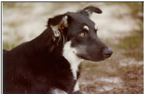
This is Kit, one of my favorite dogs. He died in 1996 after being hit by a car.

I still need more pet pics. Send me a picture of your pet, whatever it is, with just a sentence about it. Be sure and include the pet's name.