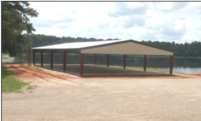
NEW BRAGG LAKE PAVILION (completed July, 2014)

R & R Barbecue which recently located at the Ouachita-Nevada county line has moved their business to Prescott. We hate to lose any type of business from this area. What we need is a little store to sell the basic necessities of life. You have to plan carefully on your shopping when you have to drive fifteen or twenty miles just to get a jug of milk or loaf of bread.