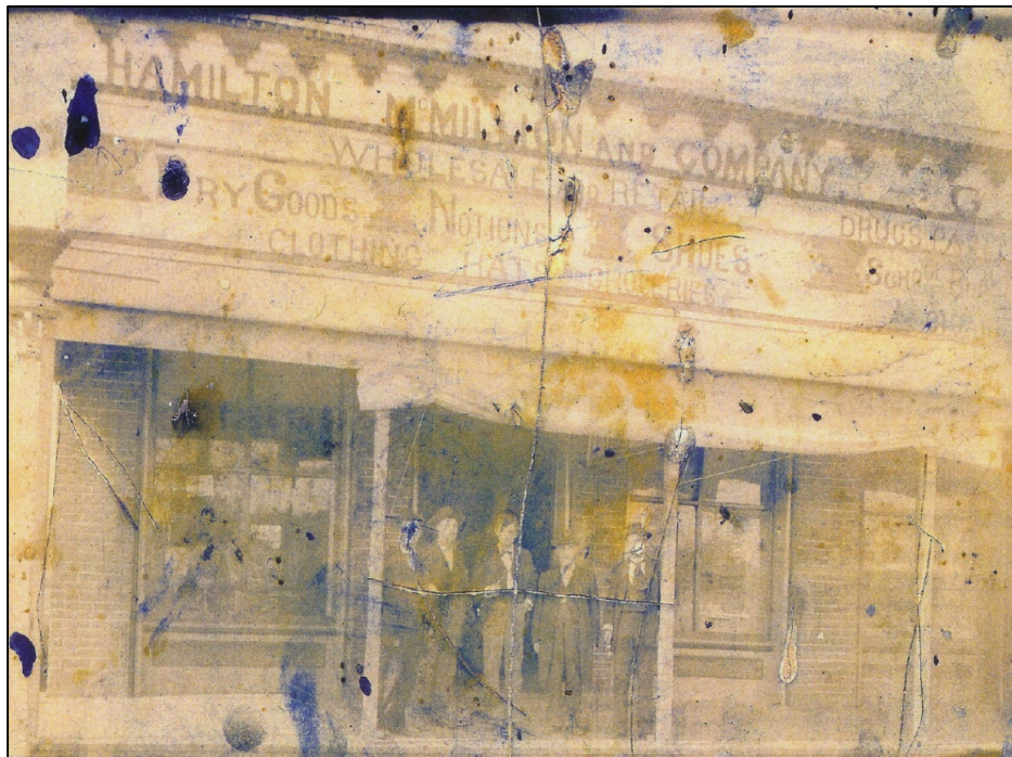
HAMILTON- MCMILLION and CO. Prescott, Arkansas