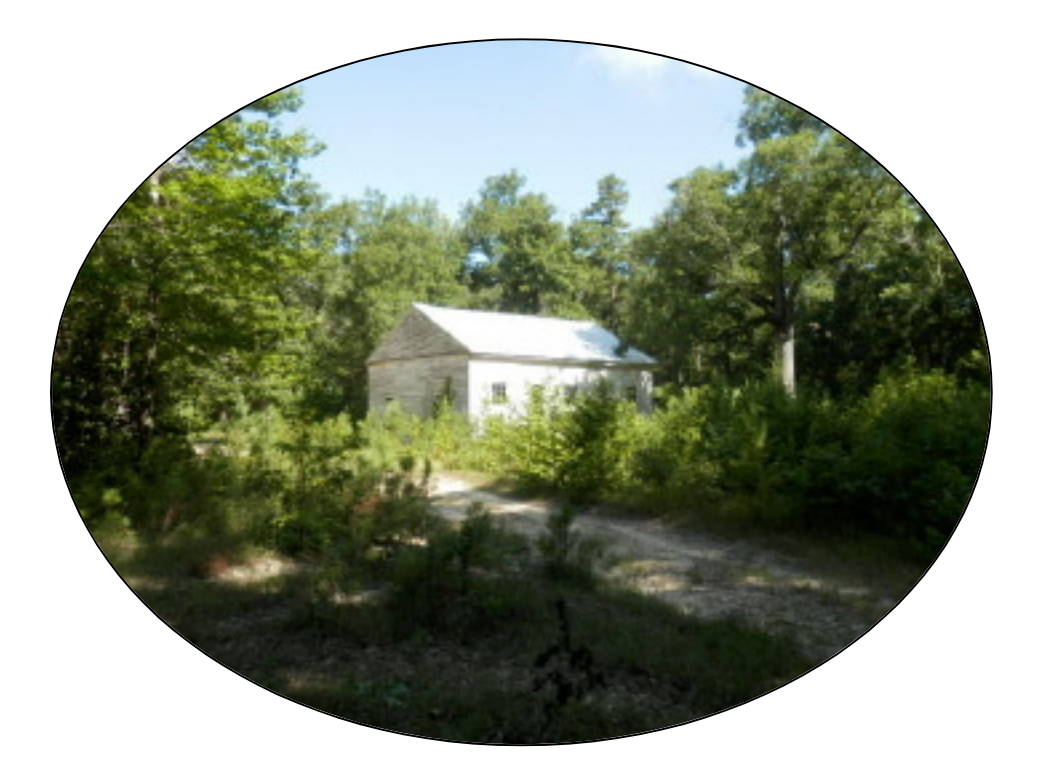
Carolina Church in 2015