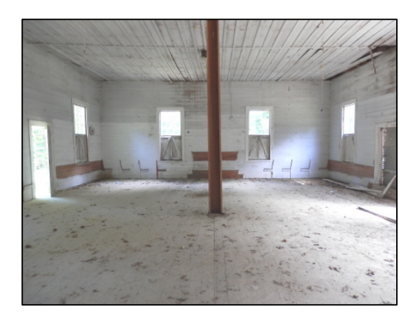
Inside view of Carolina Church