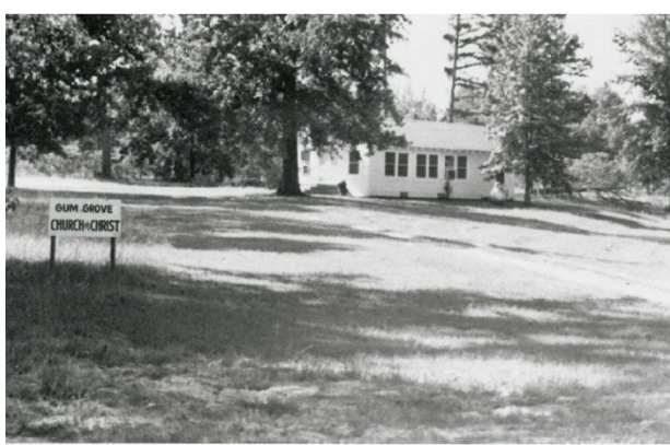
Gum Grove Church of Christ (1950s)