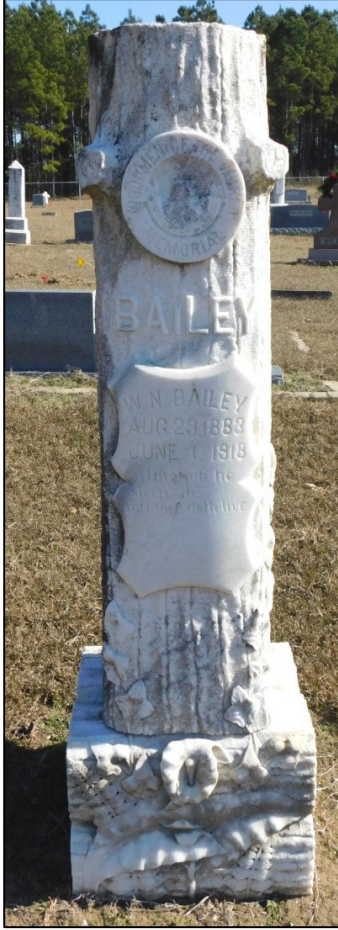
Bluff Springs Cemetery