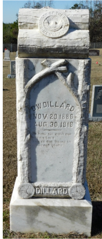
Bluff Springs Cem.