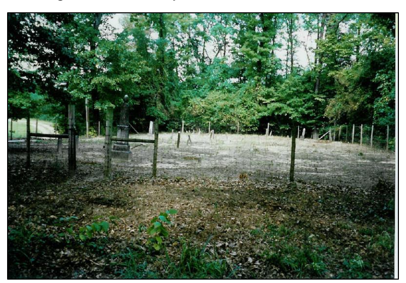
WHAT HAPPENED TO THE GULLEY PLANTATION?

I grew up a few miles from the old Gulley plantation and used to ride the old roads. I never knew about the old cemetery since it was not visible from the roads. When I started doing cemetery surveys of Nevada County cemeteries in 1997, I visited the cemetery and recorded the names of those buried there. I didn't realize at the time that I was related to some of them. Here is a picture I took of the cemetery at that time. As you can see, there are no trees left standing in the cemetery, but at least it is fenced and being maintained.