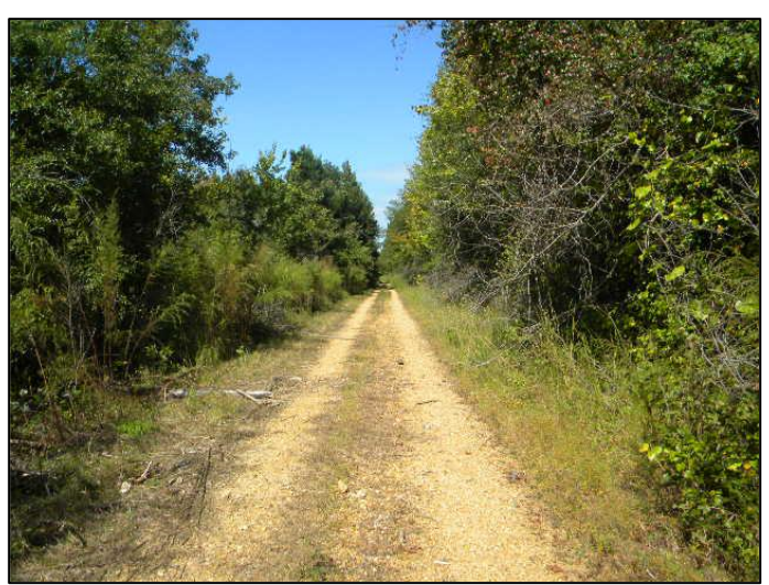
Logging road on the old Possum Trot route (between Lackland Rd. crossing and Dill's Mill)