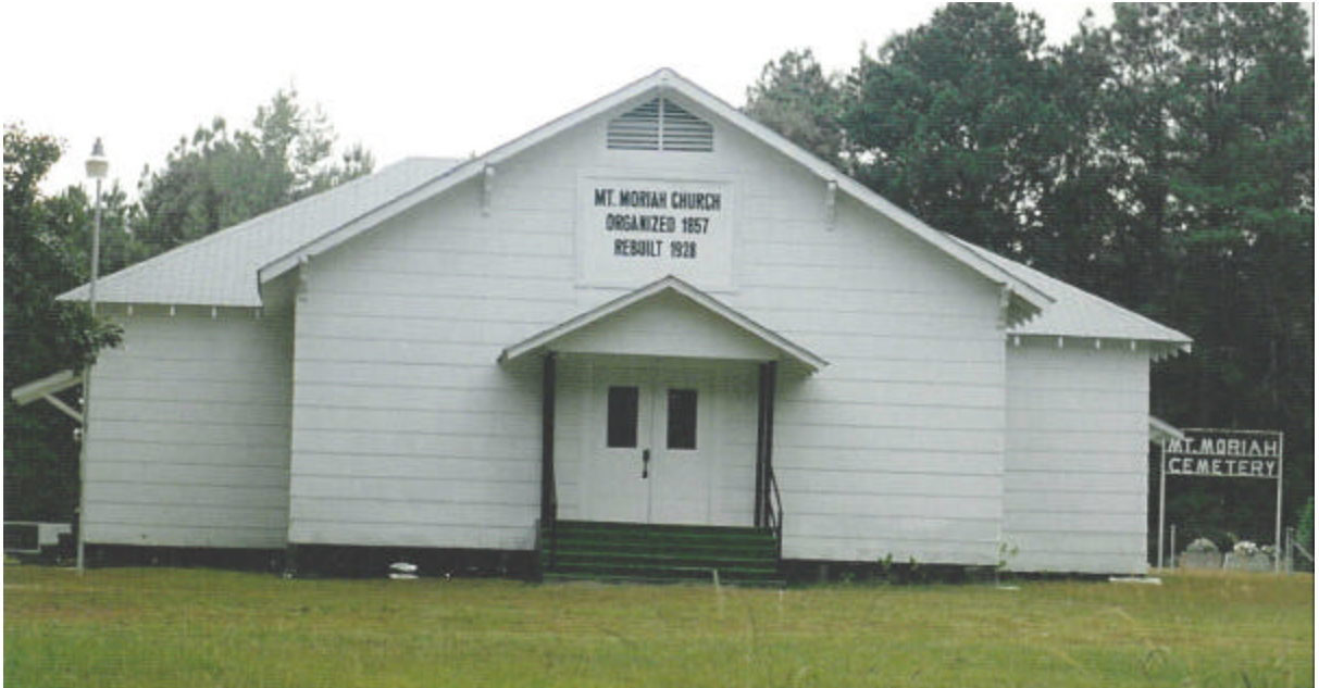
Mt. Moriah church as it appeared in 1993

This year (2007) marks the 150 th anniversary of Mt. Moriah church. An old fashioned singing has been planned for the Saturday before Mother's Day in addition to the annual Mother's Day program on Sunday.