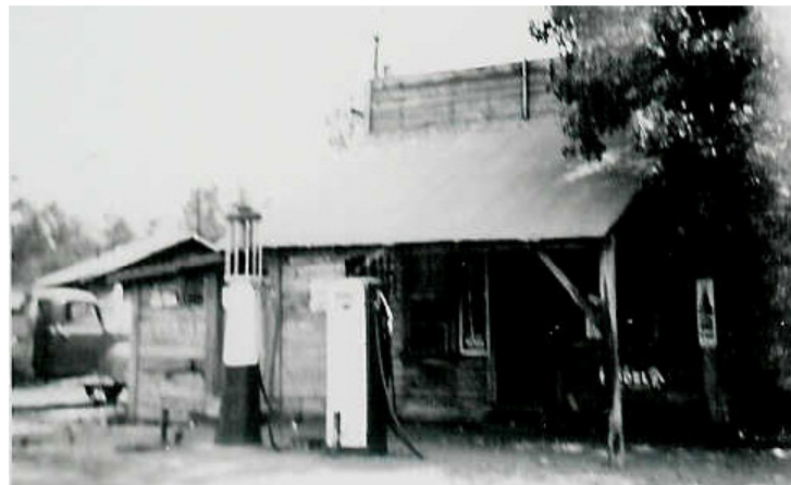
The commissary store at Caney Creek Mill