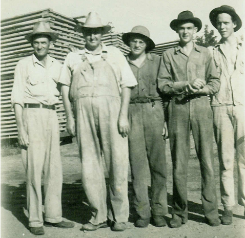
Photo taken at the mill