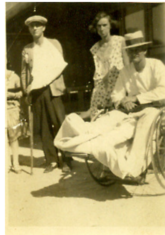
Sandy's grandpa in wheelchair