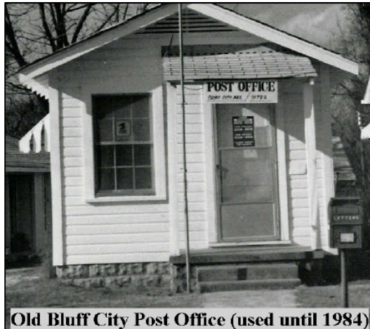
Old Bluff City Post Office (used until 1984)