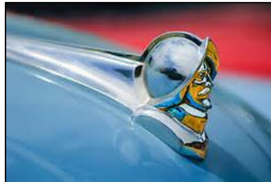
Lighted hood ornament

One time my Dad considered buying a Nash car from a salesman he knew who worked for a car dealer in Hope. He let my Dad take the car home and drive it for a few days to decide if he liked it. That was one ugly car and I was glad my Dad decided not to buy it.